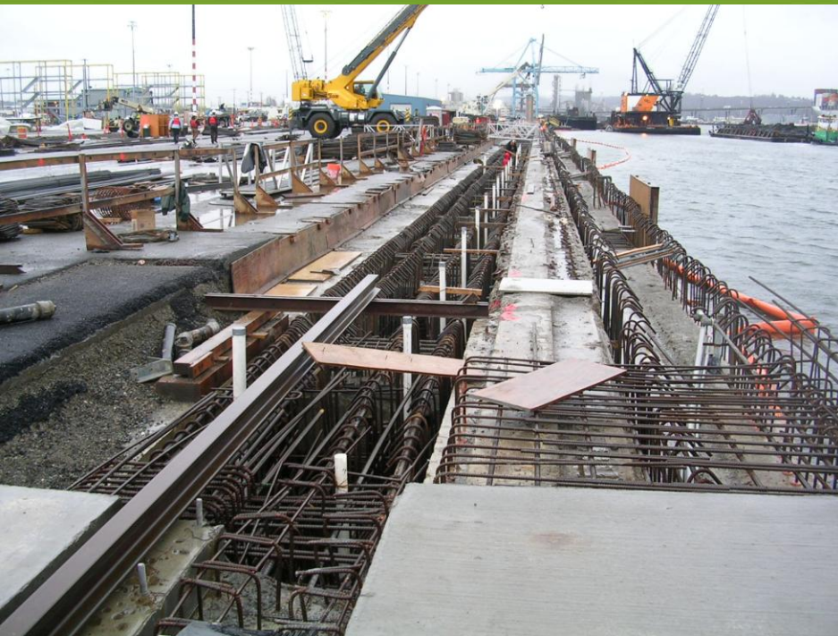
Waterside Crane Beam work January 2009