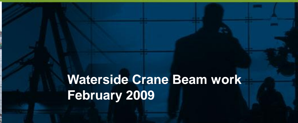
Waterside Crane Beam work February 2009