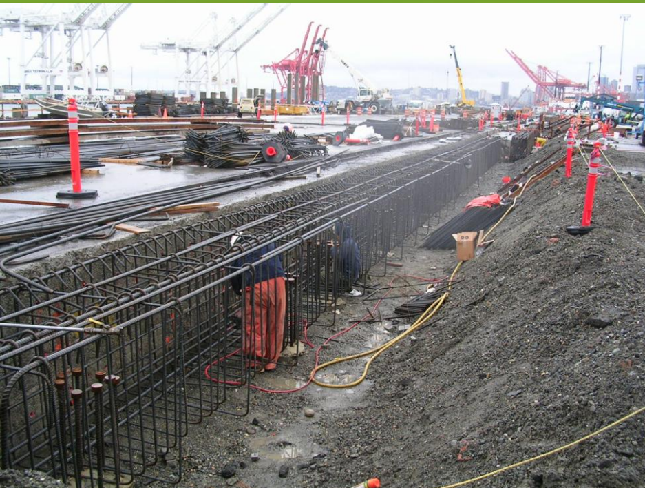
Landside Crane Beam work January 2009